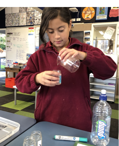
Room 5 enjoyed Teen Esteem in week 7 developing leadership skills and learning about identity through art. We also enjoyed the NZ Playhouse production last Tuesday! The performance was fun and very funny. Great to see the arts visiting Coromandel schools.